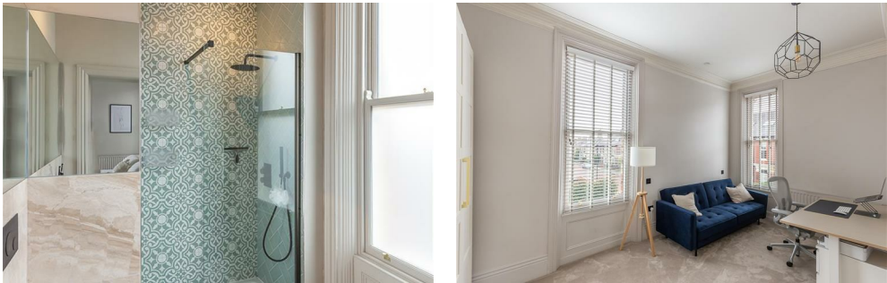
1ST FLOOR 1178 sq.ft. (109.5 sq.m.) approx.